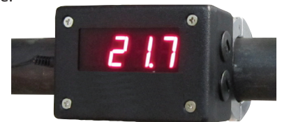
Flow Meter Display (shipped loose)

* Additional charges apply for these products.