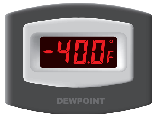
Atlas Air & Water DDM -76/+68 Digital Dew point Meter (Specs on reverse side)